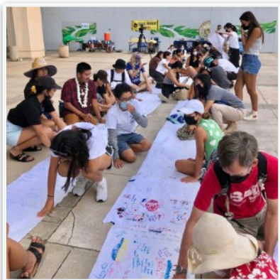
Joining scrolls of signatures in support of #ShutDownRedHill

Did waving signs as a group create the change we need? No. But just as important as the change we make is the change and spark that ignites within each of us when we come together for a common purpose. Isn't that why we come to church on Sundays to worship as a community? How we combat the climate crisis and care for creation will look different for each of us. When we rally, we bring hope to our neighbors and encourage one another to continue in our efforts toward a better world.