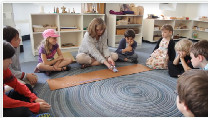
"The Sower" Full Godly Play Session

As we move into our fall programming, we do so with our eyes firmly fixed on our next exciting step forward in Children's Ministry. We are currently working toward rolling out our Godly Play program with the goal of kicking off this beautiful faith practice on the first Sunday of Advent. Godly Play is a method of faith formation that focuses on growing faith through experiential learning. This is an ambitious goal, and we will need many hands to ensure the successful launch of this next phase of ministry for our keiki.