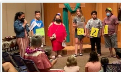
In the 11 a.m. service, youth lead the Time with Keiki, sharing about faith and action.