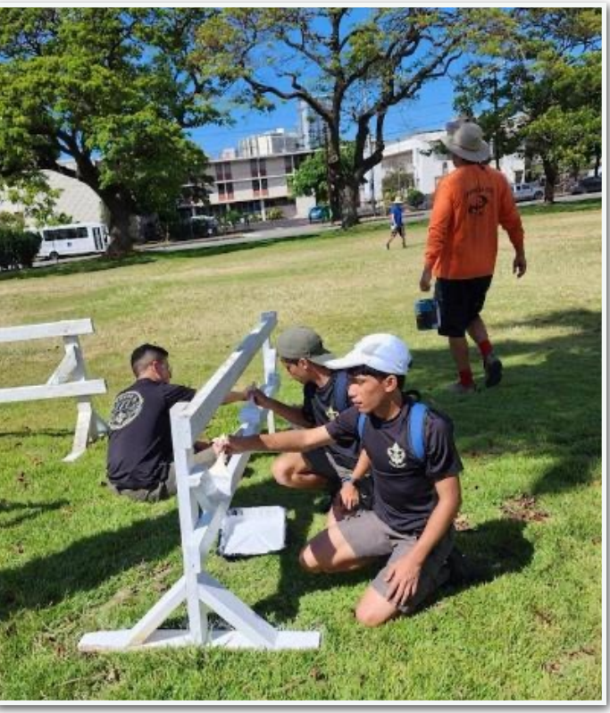
The Building and Grounds Committee and Central Union Church extend our deep mahalo to Troop 777 for a job well done!