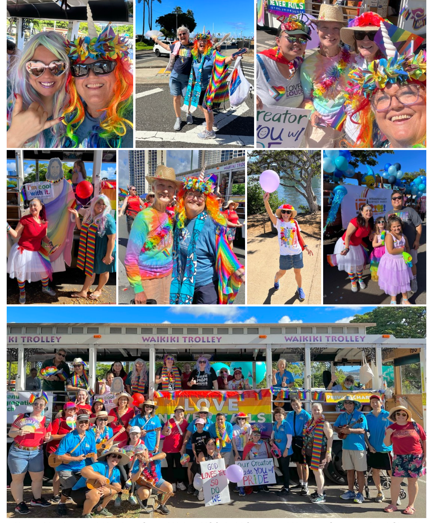
Above: Members and friends of Central Union, UCC Judd Street, and Nu'uanu Congregational Church