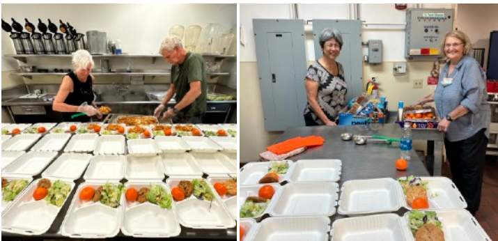
Community Ministry prepares meals for our neighbors on the 2nd Tuesdays.