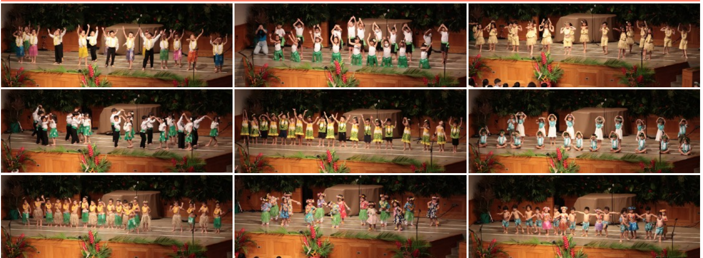
On May 3, CUPS celebrated Lei Day with their annual program entitled "Hapa Haole Hula." We're so proud of our keiki's hard work! Watching and hearing them dance and sing filled us with joy!