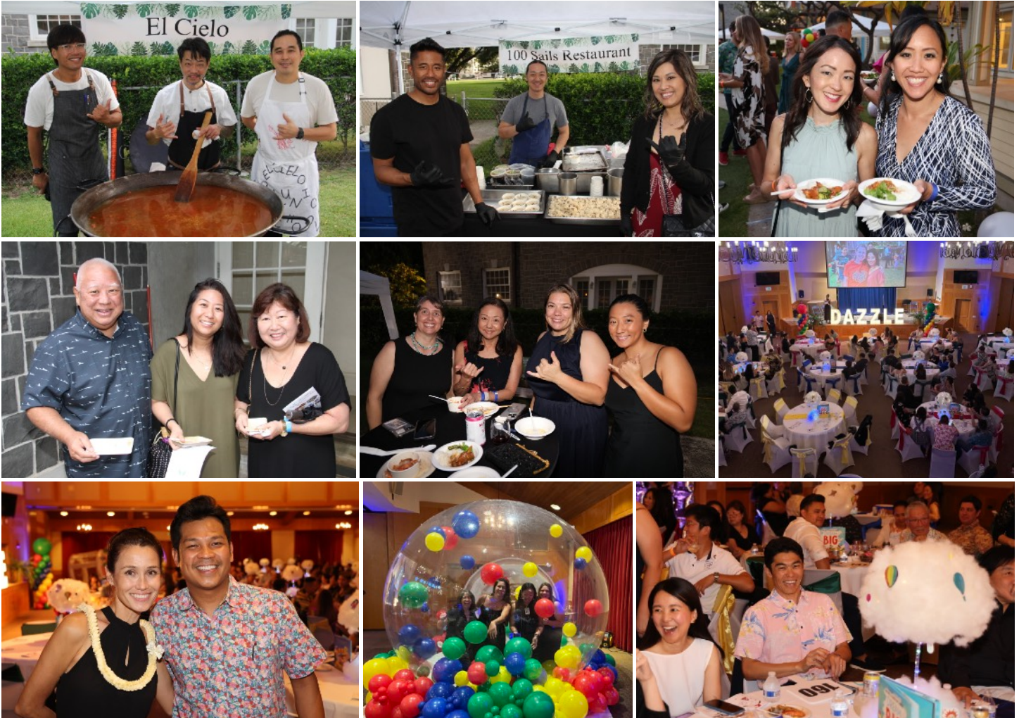
The preschool's annual Dazzle fundraiser was an enjoyable evening with fifteen local chefs and delicious dishes, close to 200 guests, and over 100 items up for auction in person and online!