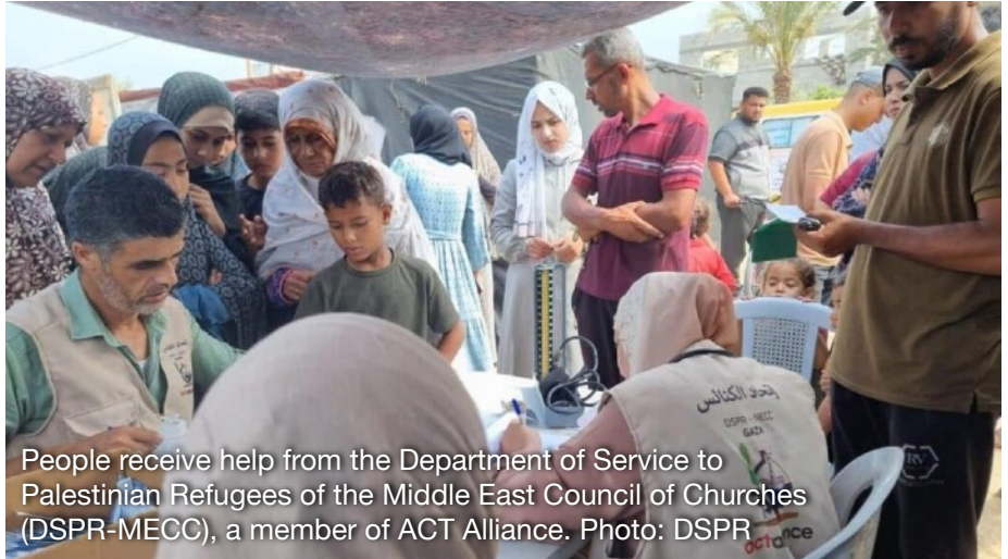
People receive help from the Department of Service to Palestinian Refugees of the Middle East Council of Churches (DSPR-MECC), a member of ACT Alliance.