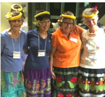
Left: Women wearing urohs (traditional Pohnpeian skirt) gifted to them at the Women's Retreat.