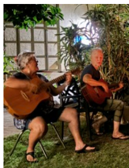
Right: Women around a campfire where they sing, dance, laugh, share together!